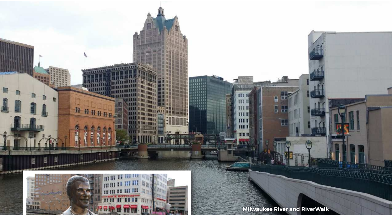
Milwaukee River and RiverWalk