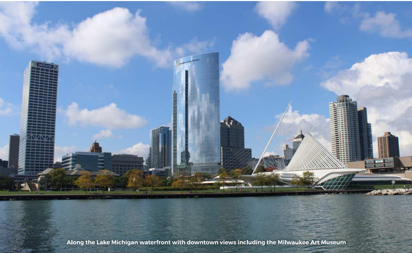
Along the Lake Michigan waterfront with downtown views including the Milwaukee Art Museum