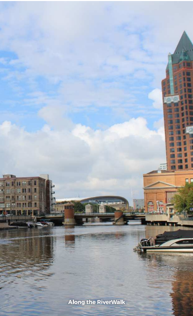
Along the RiverWalk