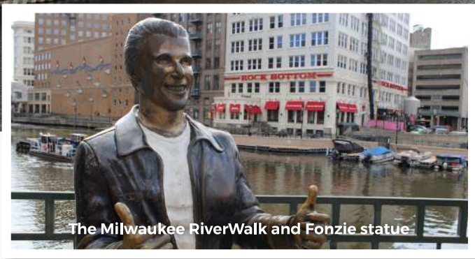
The Milwaukee RiverWalk and Fonzie statue