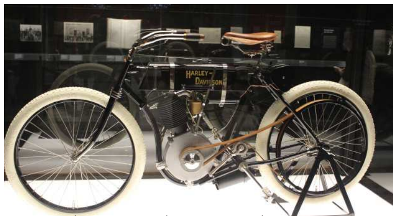
Serial Number One in the Harley Davidson Museum