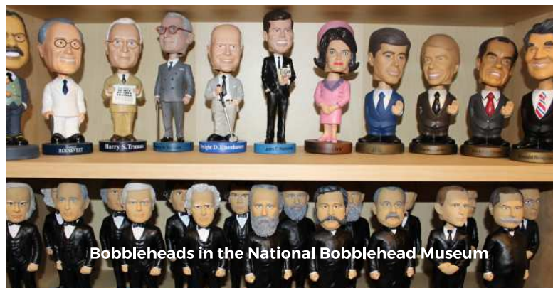
Bobbleheads in the National Bobblehead Museum