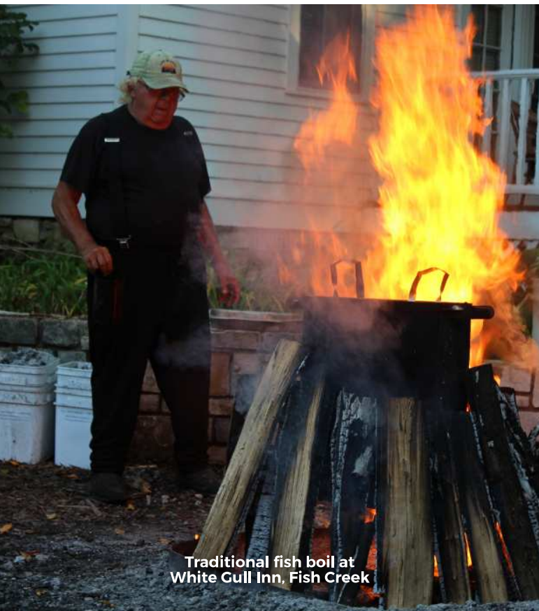
Traditional fish boil at White Gull Inn, Fish Creek