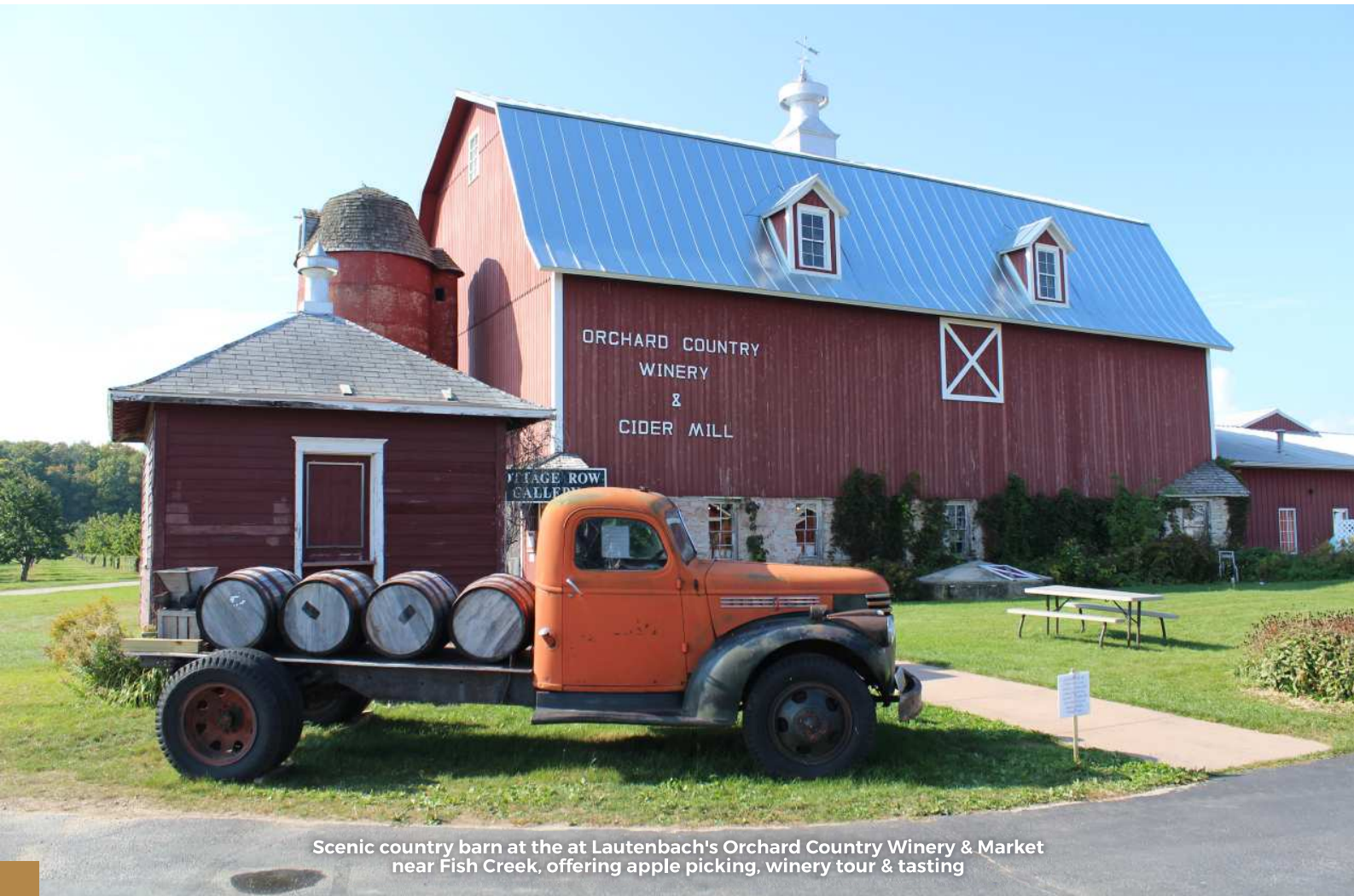
Scenic country barn at the at Lautenbach's Orchard Country Winery & Market near Fish Creek, offering apple picking, winery tour & tasting