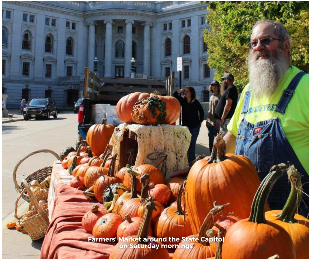
Farmers' Market around the State Capitol on Saturday mornings