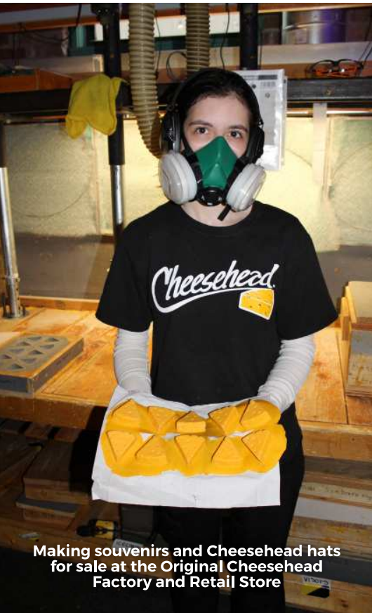
Making souvenirs and Cheesehead hats for sale at the Original Cheesehead Factory and Retail Store