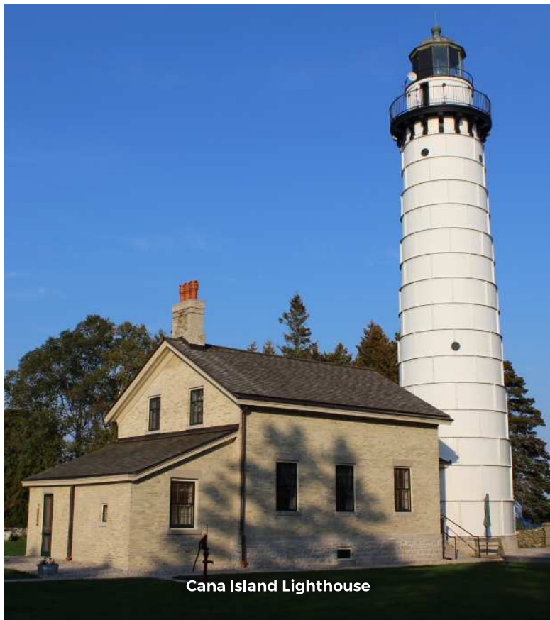
Cana Island Lighthouse

years ago as an economical way to feed hungry anglers and lumberjacks. The recipe includes adding potatoes to a boiling cauldron over a wood fire, and when cooked, adding chunks of locally caught whitefish. At nightfall, we stop by Fish Creek's White Gull Inn to watch the preparation resulting in a dramatic fire flash when kerosene is poured onto the fire to burn off fish oils surfacing to the top.