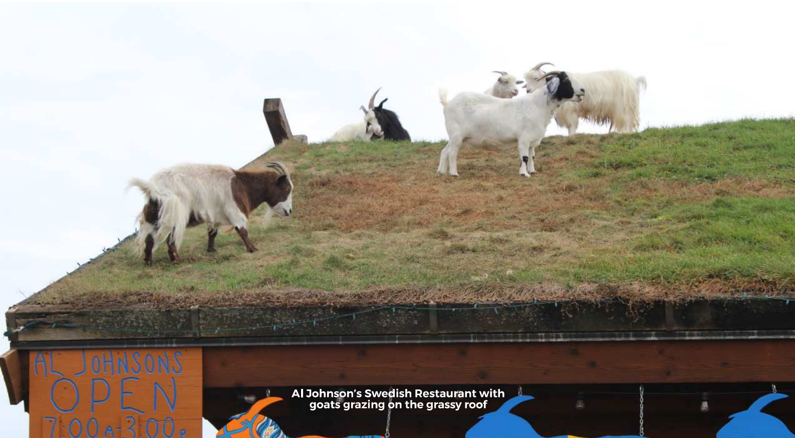
Al Johnson's Swedish Restaurant with goats grazing on the grassy roof