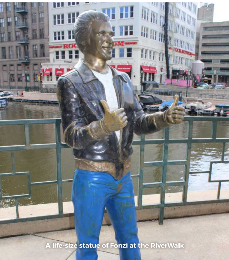
A life-size statue of Fonzi at the RiverWalk