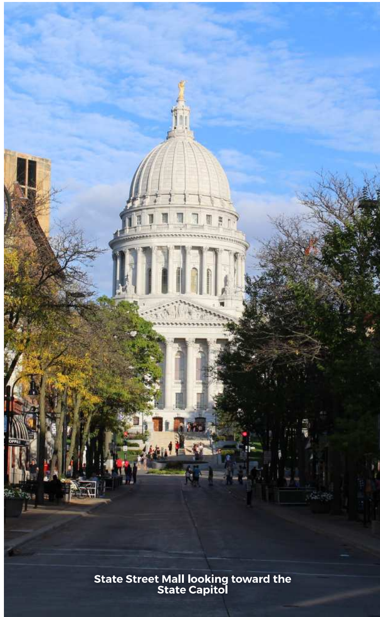
State Street Mall looking toward the State Capitol

than 6,000 bottles from all 50 states and more than 80 countries. There's "Moosetard" from Alaska, Maui Onion Mustard from Hawaii, Louisiana Gourmet Cajun Mustard, and Vermont Maple Mustard, to name a few.