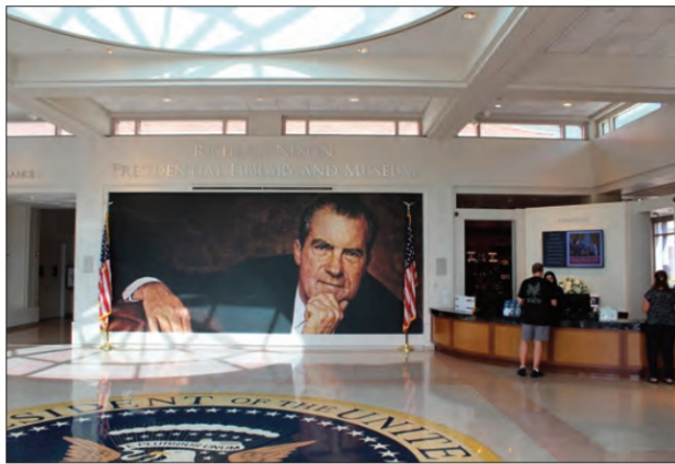
Richard Nixon Presidential Library and Museum in Yorba Linda, Calif.