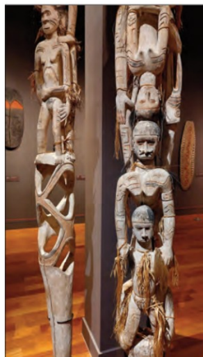
The Bowers Museum houses more than 90,000 ancient objects.

"It's often called the magic isle," I recall Fornasiere telling me. "It's like Southern California untouched."