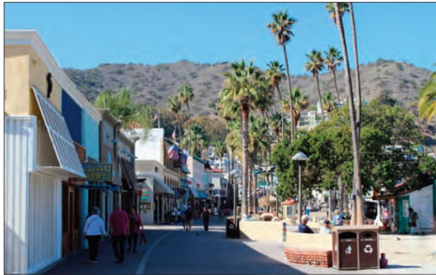
Avalon street views, where traveling on foot or in a golf cart is the norm.